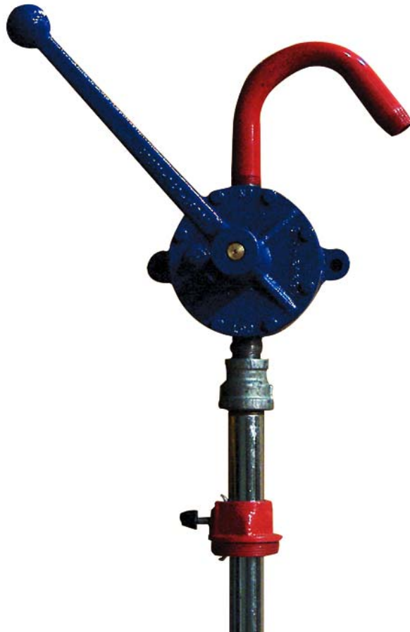
MODEL HO 3/4A4-36DK SHOWN